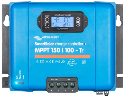
SmartSolar Charge Controller MPPT 150/100-Tr with optional pluggable display