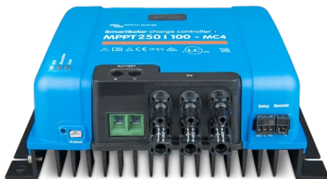
SmartSolar Charge Controller MPPT 150/100-MC4 without display