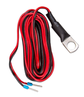
Temperature sensor for Quattro, MultiPlus and GX Device (such as the Cerbo GX)